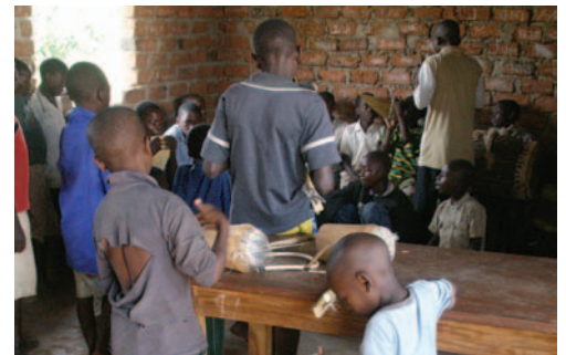
Holding government to account. UDN has been monitoring school construction and education spending in rural Uganda.

While budget analysis and advocacy activities have expanded dramatically in Africa, Asia, and Latin America over the past decade, no material has been systematically gathered on the impact of such work. Therefore, civil society groups interested in undertaking budget work have little access to the experiences of the pioneering organisations. This Briefing Paper summarises